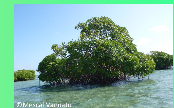
Komon Nem: Long Stilt Mangrove Bislama Nem: Red Natongtong