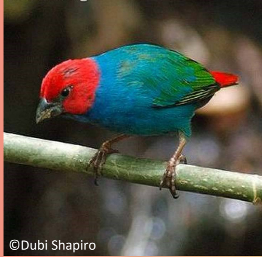
Komon Nem: Royal Parrot Finch Bislama Nem: Parot