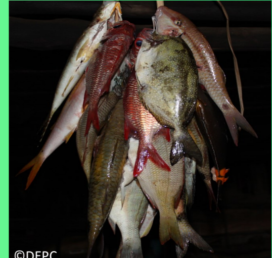
Komon Nem: Reef Fish Bislama Nem: Ol Rif Fis