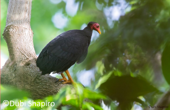
Komon Nem: Incubator Bird Bislama Nem: Namalao