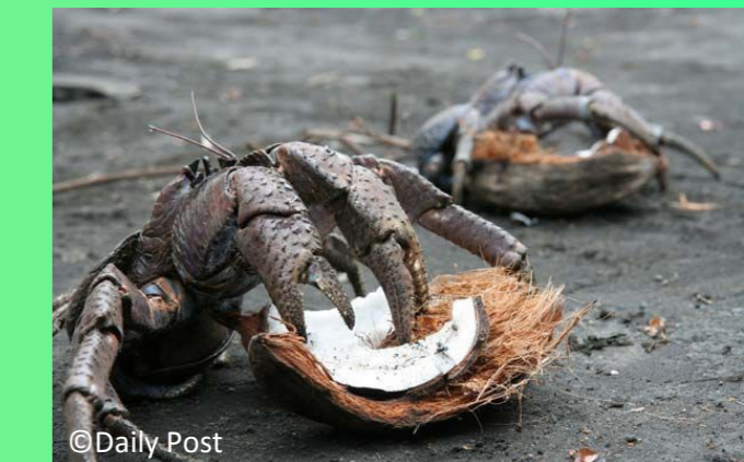
Komon Nem: Coconut Crab Bislama Nem: Krab kokonas