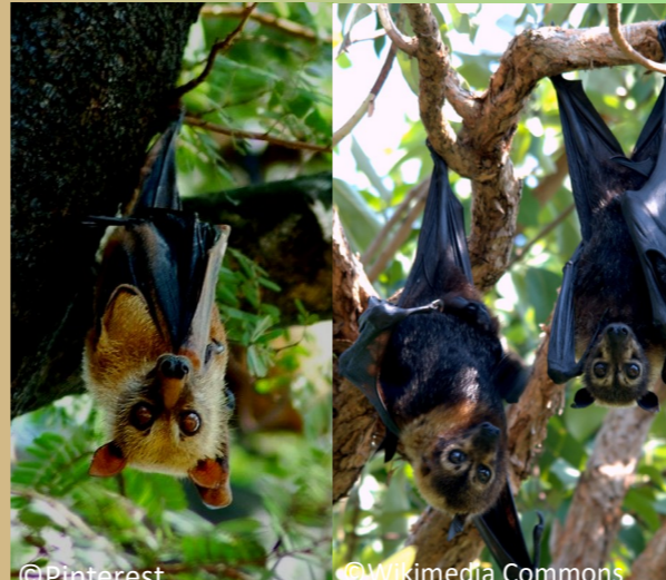
Komon Nem: Vanuatu Flying Fox & Black Flying Fox Bislama Nem: Waet mo Blak Flaen Fokis