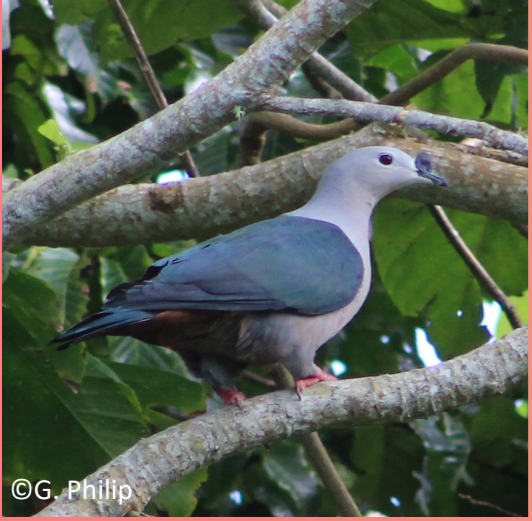
Komon Nem: Pacific Imperial Pidgeon Bislama Nem: Nawimba