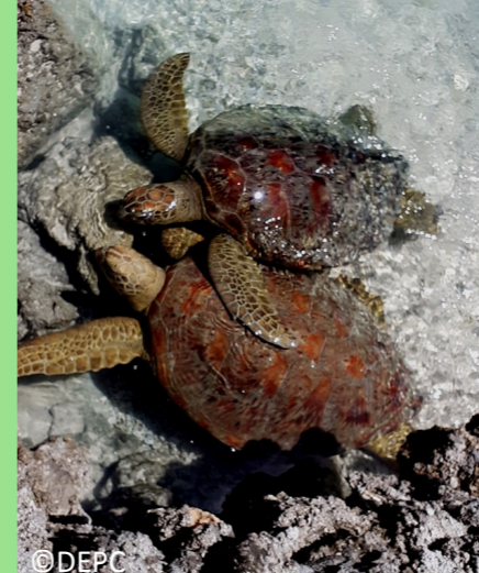
Komon Nem: Green Turtle Bislama Nem: Grin Total