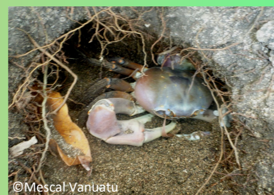
Komon Nem: White Mangrove Crab Bislama Nem: Waet Krab