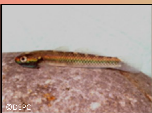
Saentivik Nem: Stiphodon Kalfatak Bislama Nem: Smol fish blong riva

Ol animol mo ol plant ia oli spesel mo impoten from se yu save faenem plante long olgeta nomo araon long ol eria ia long map, so yumi mas lukaotem gud mo protektem gud olgeta blong Eko-Turisim Oppotunitis, Saentivik Risej mo blong fiuja jeneresen.