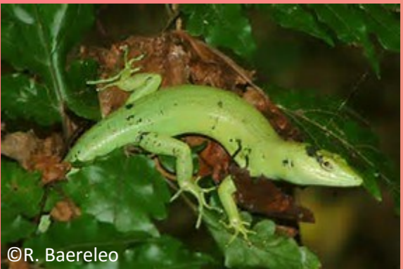
Komon Nem: Green Tree Skink Bislama Nem: Grin Liset