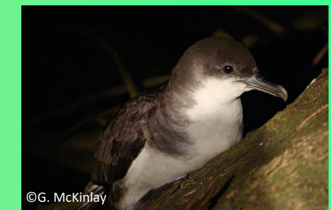
Komon Nem: Tropical Shearwater Bislama Nem: Koroliko