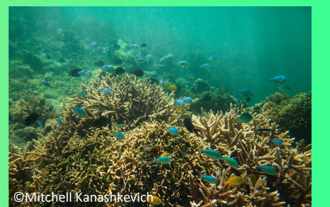
Komon Nem: Coral Polyps Bislama Nem: Ol Korel