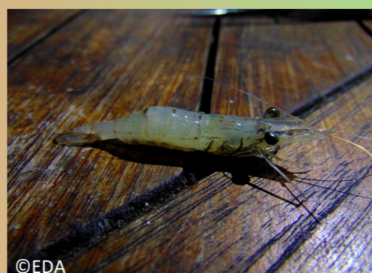
Komon Nem: River Prawns Bislama Nem: Naora blong wota