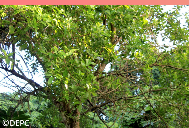
Komon Nem: Vanuatu Sandalwood Bislama Nem: Sentawud