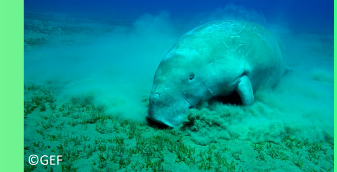
Komon Nem: Dugong Bislama Nem: Cow Fis