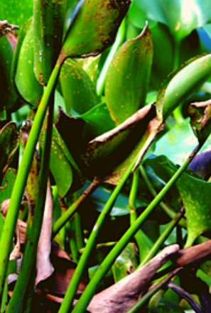
Letes blong wota