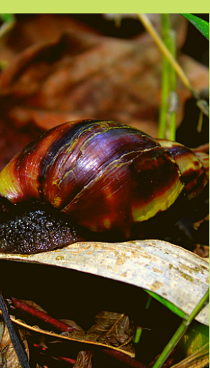
Snel bong Afrika